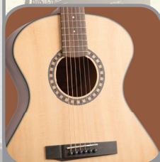
SOLID SOUND BOARD