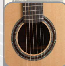
SOLID WOOD BODY W/ABALONE APPOINTMENTS