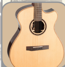
SOLID SOUND BOARD, SOLID BACK & UPGRADED APPOINTMENTS