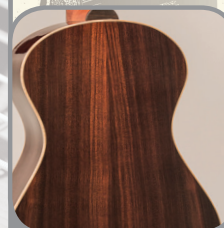
SOLID WOOD BODY